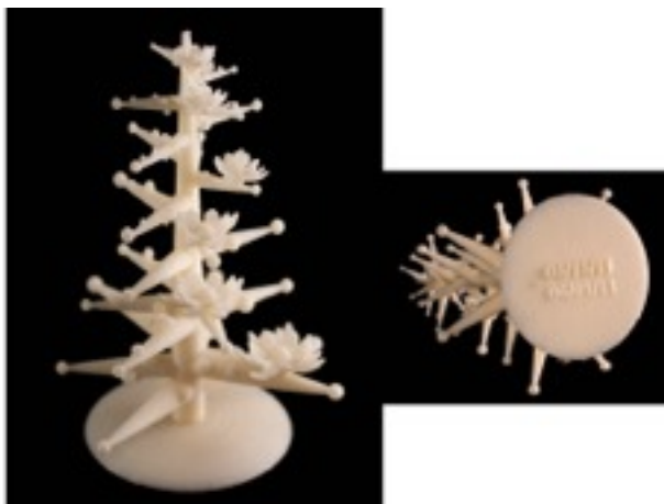
Figure 5. Personal Data Sculpture

about them, what they have learned about PUCK through their interactions, and how the two have worked together to establish a sense of place within SCA. This data sculpture is printed by PUCK into a tangible 3D object for an inhabitant after a number of milestones have been reached between the building and the inhabitant. Inhabitants are then lead to their personal data sculpture by following their identicon to a collection point within the building.