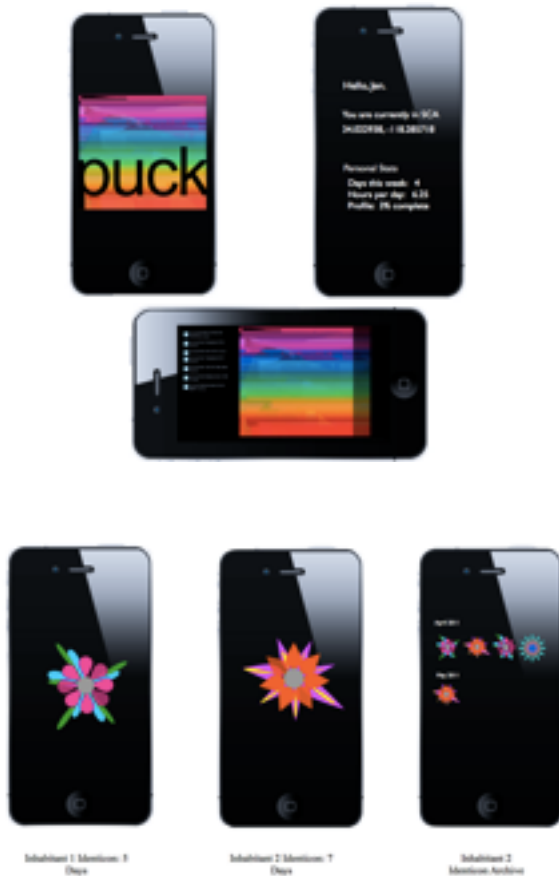
Figure 1: Puck mobile phone interface

Data Visualization and Twitter: Data generated by each building is presented to inhabitants in real time through a dynamic data visualization (see Figure 2). This data visualization provides a glimpse into daily building activity and is viewable on various displays within the common