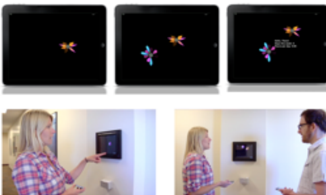
Figure 3. The building personally engages inhabitants through personalized data Identicons

Personal Engagement with Buildings: After inhabitants are introduced to the kinds of stories the building tells through its data visualization and Twitter, the building will begin to directly engage specific inhabitants through visual and sonic interactions within the common spaces of the